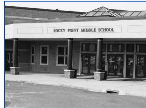
Rocky Point Middle School Grades 6-8 Phone: 631.744.1603 FAX: 631.886-0000 76 Rocky Point-Yaphank Road Rocky Point, NY 11778