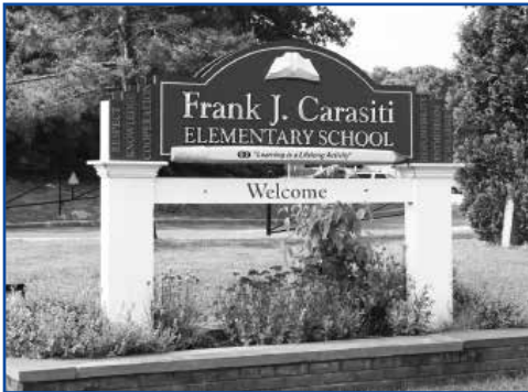
Frank J. Carasiti Elementary School Grades K-2 Phone: 631.744.1601 FAX: 631.744.1396 90 Rocky Point-Yaphank Road Rocky Point, NY 11778

Be sure to “follow” the district’s official Instagram page by searching “Rocky Point Schools” or scanning the QR code to the left.