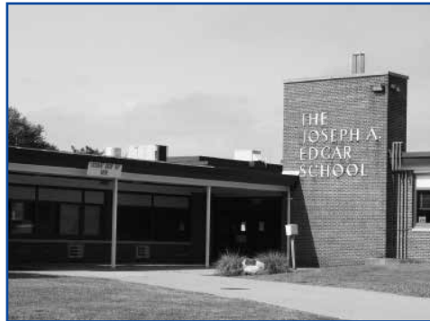
Joseph A. Edgar Intermediate School Grades 3-5 Phone: 631.744.1602 FAX: 631.744.4898 525 Route 25A Rocky Point, NY 11778