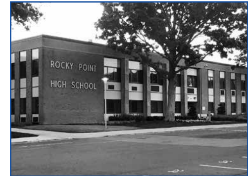
Rocky Point High School Grades 9-12 Phone: 631.744.1604 FAX: 631.591.0146 82 Rocky Point-Yaphank Road Rocky Point, NY 11778